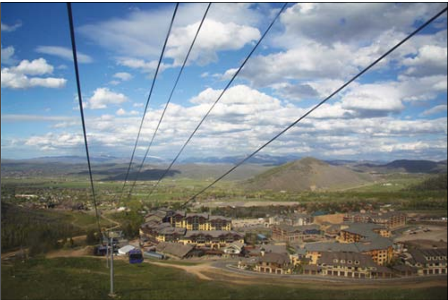
The Canyons Resort in Park City, Utah as seen from the gondola ride up the mountain