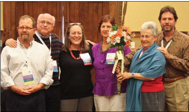
The Alliance Leadership Team is acknowledged for their efforts in launching the organization