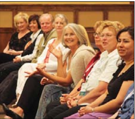
Attendees contribute during the heartfelt closing ceremonies