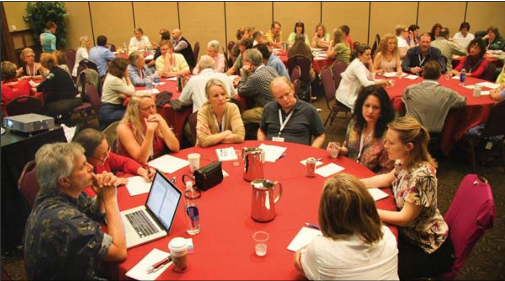
Educators from all aspects of the field discuss key issues at the visioning meeting